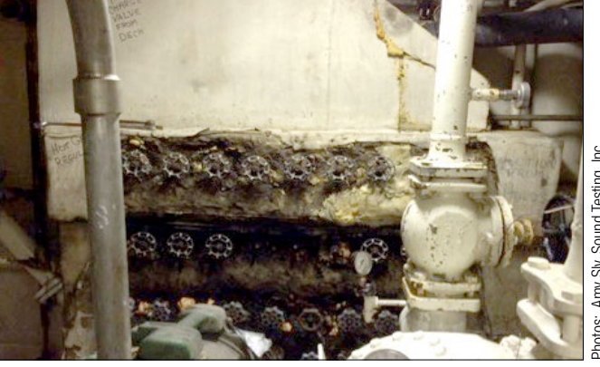
Examples of refrigeration systems aboard vessels.